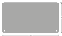
EM EXIT PICTO BLANK